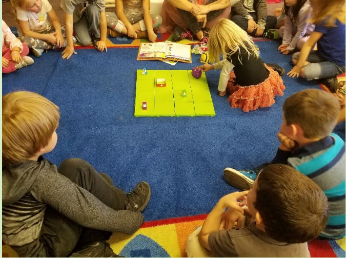
Their next object was to program a path to get "Mimi Mouse" to the three things it needed to survive: food, water, and shelter, while avoiding danger (a cat).