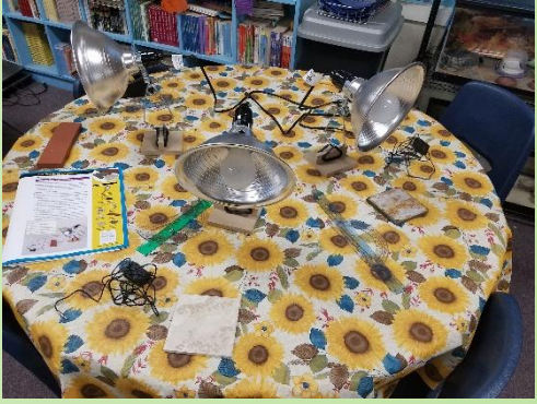
Students also observed that the heat energy from the sun varies, depending on the time of day and the angle that the sun's energy hits the house.